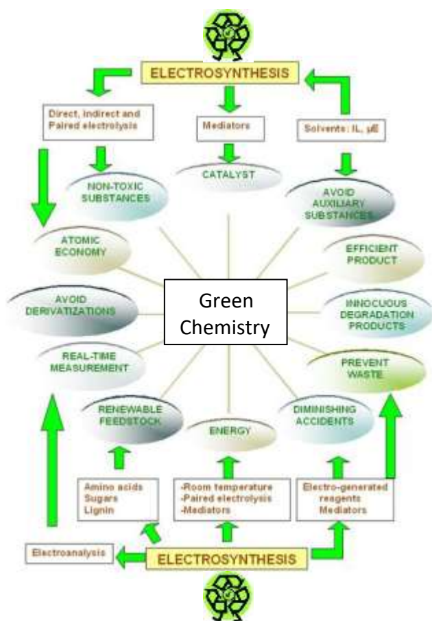
Sustainable biorefineries concept

In this talk, the main aspects that make organic electrosynthesis a promising method in green organic synthesis will be discussed. Cost, advantages, and disadvantages, as well as some representative examples from literature and my research group will demonstrate that organic electrosynthesis is in a renaissance period. The organic electrosynthesis principles and benefits can also be used in the sustainable biorefineries, where environmentally friendly methodologies are required to obtain valuable chemicals from renewable biomaterials like lignin, fatty acids and glycerol.